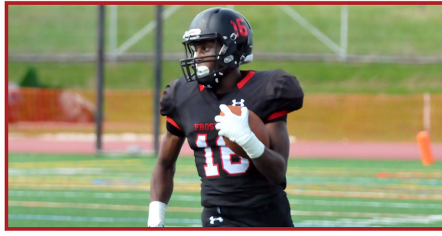
Frostburg is 5-0 for the first time since 1999